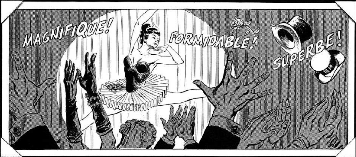
... danced briefly with the Grand Ballet du Marquis Cuevas ...