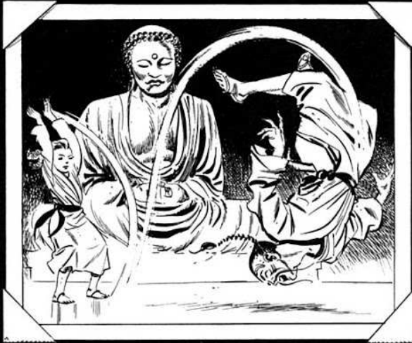
where she mastered the mysteries of oriental combat arts...