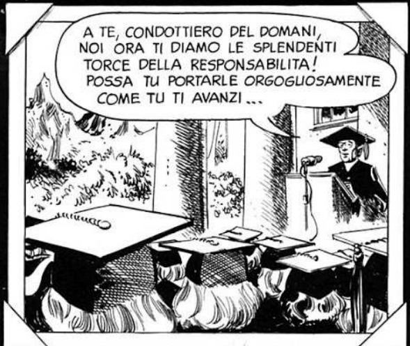
... completed her education at an exclusive Swiss finishing school...