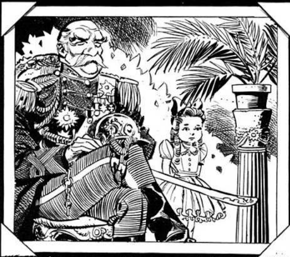
daughter of a Serbian aristocrat...