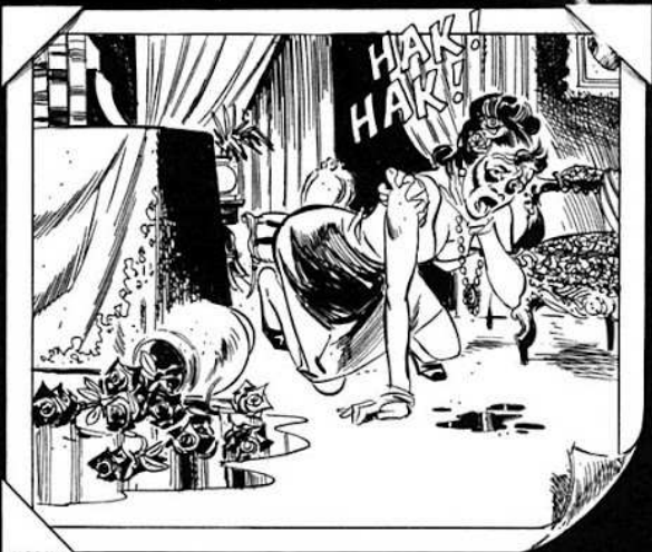
and then, upon the insistence of her father (her mother having perished of tuberculosis in 1947)...