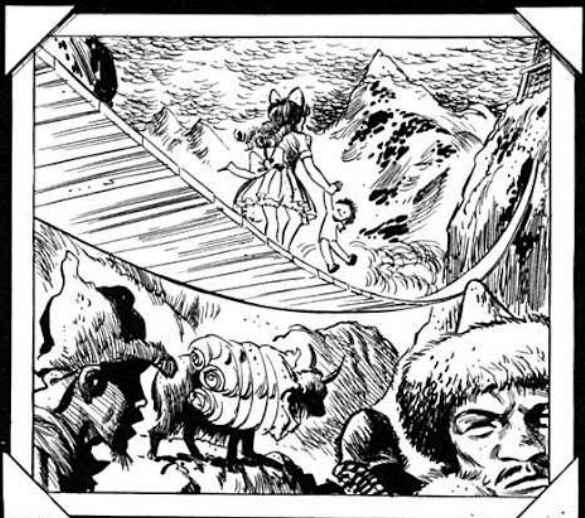
raised in Northern Tibet...