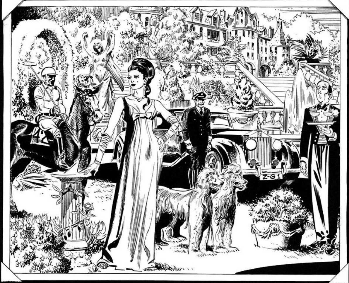
Wealthy 24 year old sophisticate, Phoebe Zeit-Geist...

Written by MICHAEL O'DONOGHUE - drawn by FRANK SPRINGER