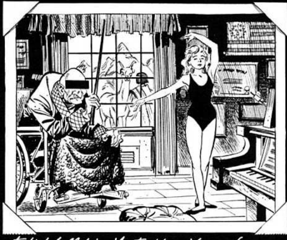
studied ballet in Montevideo with one whom many still refer to as "Sergei Diaghilev's most brilliant protégé" (and who must, at this time, remain nameless)...