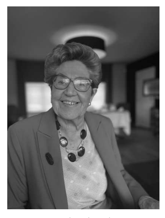
my mother at the age of 93

My mother went to work as a secretary in the Ambiorix shoe factory in Tongeren . When we, children in the sixties, came there (1958, 1959, 1960, 1962, and 1966), she stayed at home to take care of the family. Years later, she began to get more and more involved in the local women's association. She soon became a tour guide and made group trips with 'her women' . In my forties, I happened to become a musical tour guide myself as well. My mother is a woman who doesn't mince her words. She has a temperament; she is a brave woman who loves her children and is proud of them.