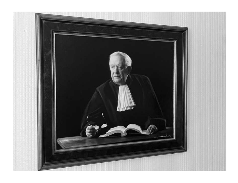
father in his office as a justice of the peace