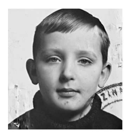
Somewhere in the sixties

Yet writing notes, texts and diaries has almost always remained a constant. They mainly serve to reread fragments of compositional processes and to reflect on them further.