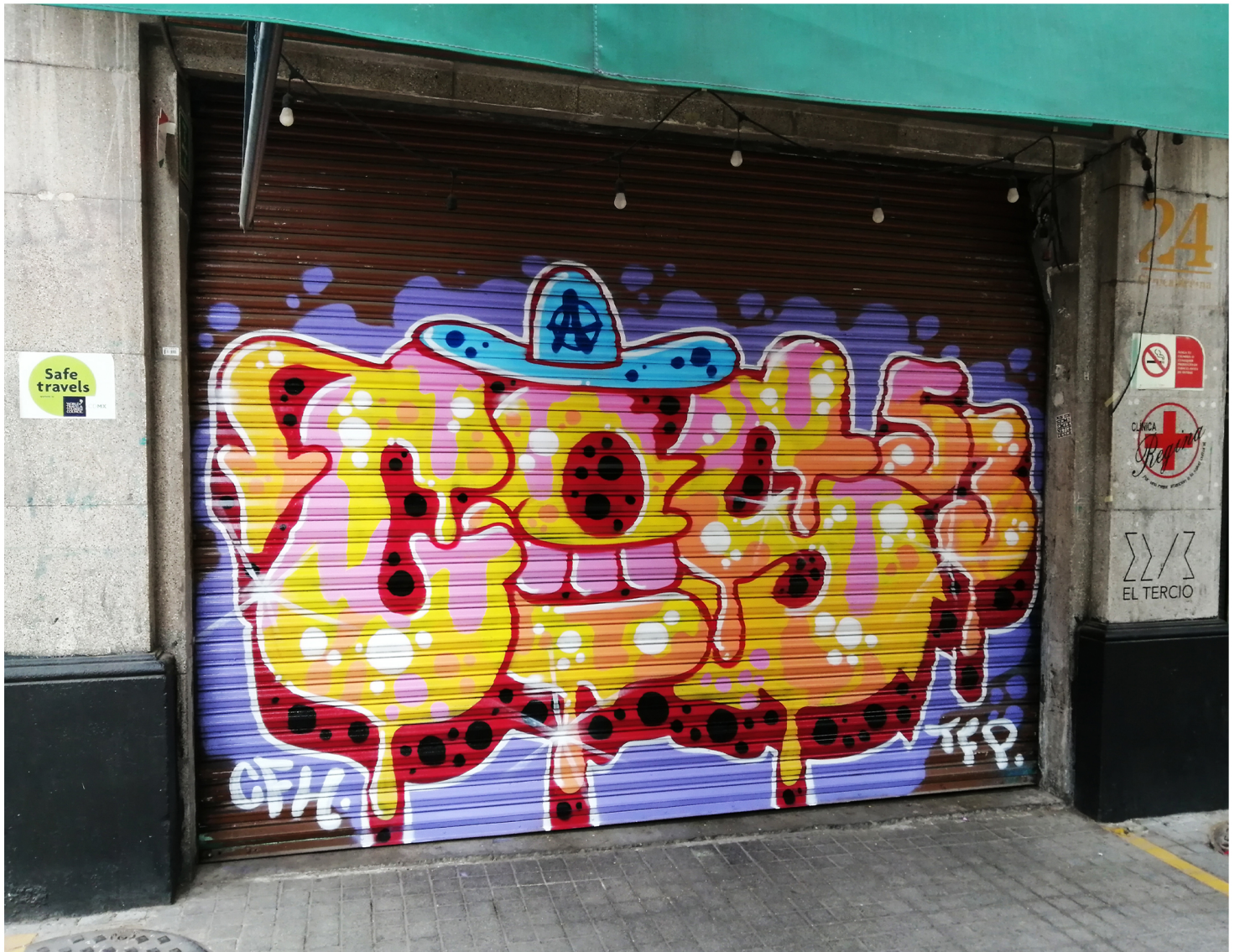
First piece in Mexico city, August 29, 2021.