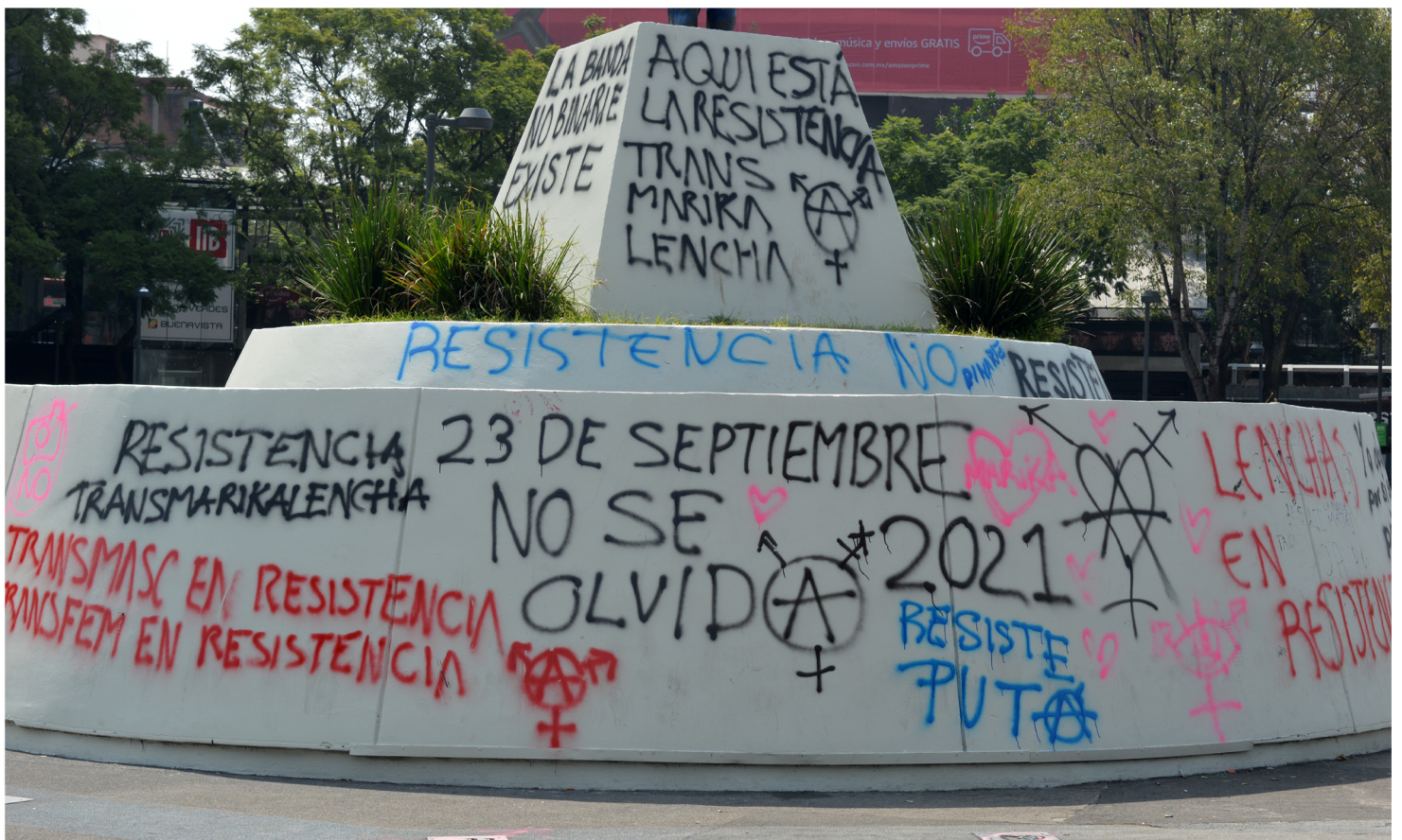
Mexico city protest graffiti.