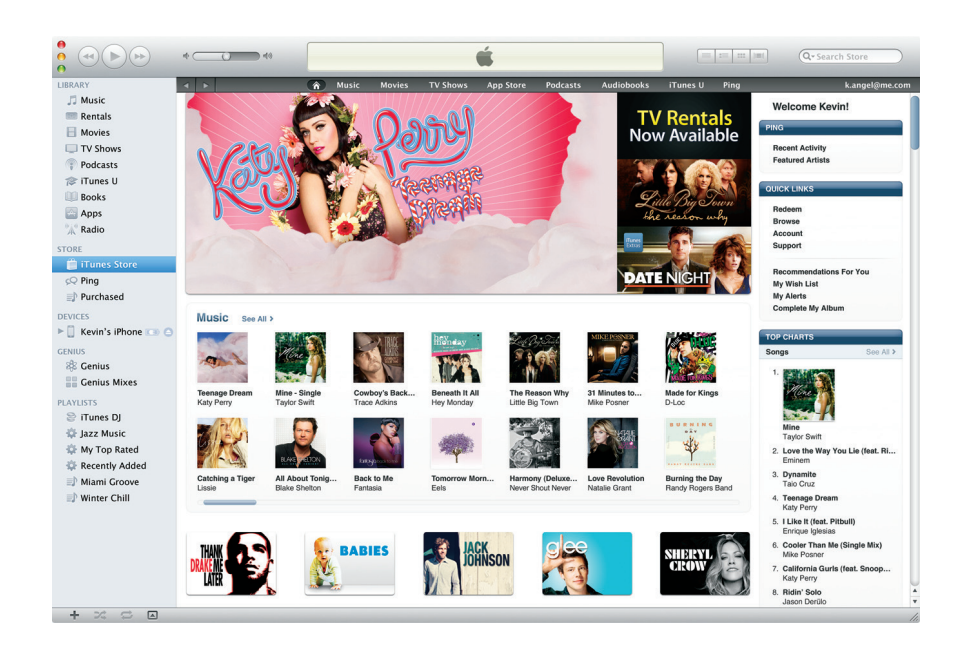
Image 1.2: The introduction of the 'iTunes Store' channel fundamentally changed the sale of music, films, games, books and other items