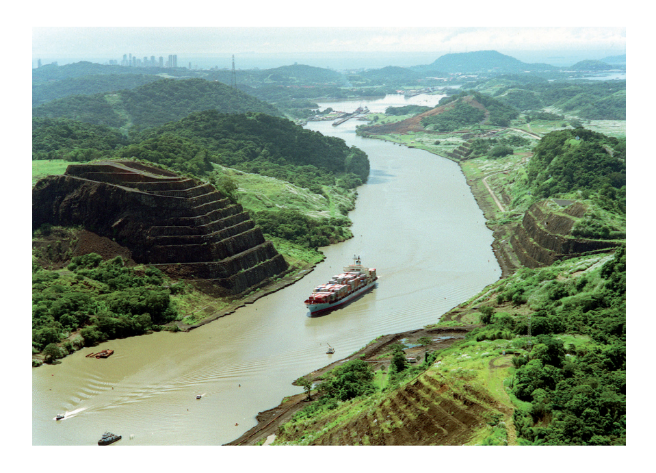
Illustration 1.1: The Panama Canal

The Suez and Panama Canals are, of course, channels in the most literal sense of the word. But they are very similar to the channels that are discussed in this book. The use of channels opens up the possibilities for reaching new or existing target groups with new or existing products and services. And changes of momentous proportions are occurring regularly. Consider for example Apple's innovation with the introduction of iTunes. Since 2001 this new channel has caused fundamental, permanent changes in the business models for music, films, games and books. The same applies to Dell, that completely changed the market for PCs in 1985 by selling directly to customers without going through resellers.