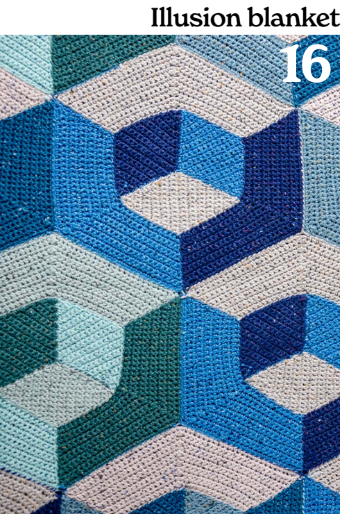
Illusion blanket 16