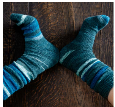
46 Lente socks