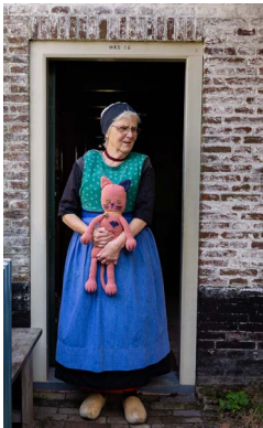
8 Numi the cat