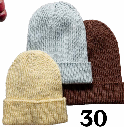
30 Family beanie