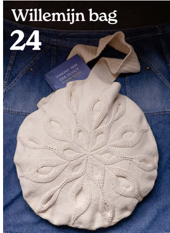
Willemijn bag 24