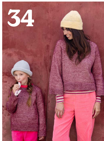
34 Mini & me sweaters