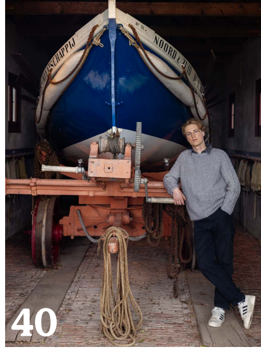
40 Frits fisherman jumper