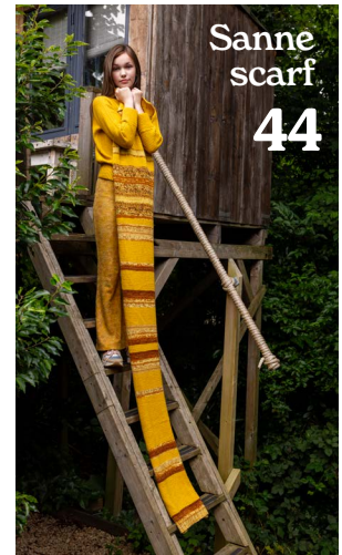
Sanne scarf 44