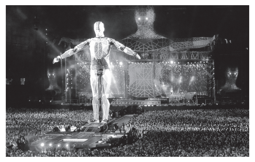
For a series of stadium concerts Take That used this immense steel figure that slowly rose from a crouched to a standing position.

If customer experience is leading (the emotional value loop), companies tend to concentrate on more qualitative performance indicators, like internal coordination, customer satisfaction and customer delight, loyalty and Net Promotor Score. Then the pivotal question is: what do we need in order to create and enhance customer experience, and how far can we go so that (more) customers are willing to pay for the exercise? The overwhelming popularity and success of dance festivals proves that – even in times of recession – many people are willing to pay high prices to attend a performance and event that creates a unique value for them. For the producers of these festivals, efficiency was not at the top of their agenda.