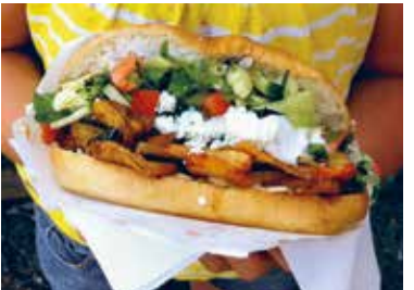
FOOD AND DRINKS 100 GOING OUT 122