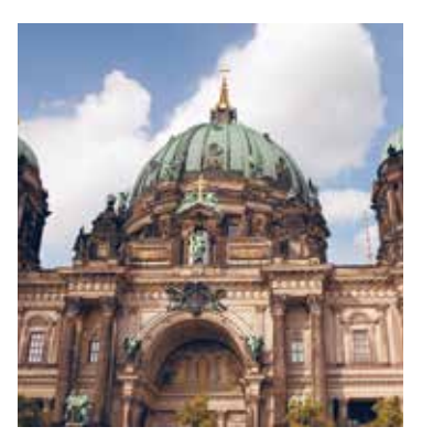
WHEN TO TRAVEL 28 BERLIN LIFE 38