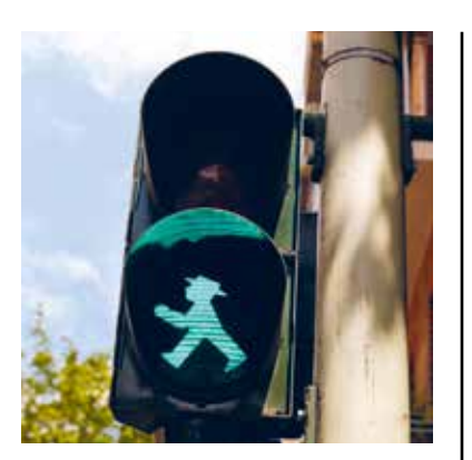
GREEN BERLIN 166 OUTSIDE OF BERLIN 182