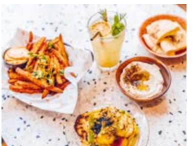
FOOD AND DRINKS 100 GOING OUT 122