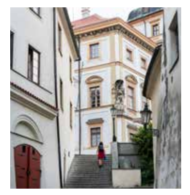
WHEN TO TRAVEL 28 LIFE IN PRAGUE 38