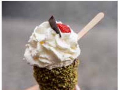
FOOD AND DRINKS 102 GOING OUT 126